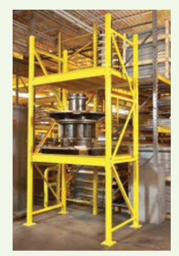
For added strength, fully welded tubular steel is used for both horizontal and diagonal bracing.

SK4000 is available with a bacteria-resistant finish.