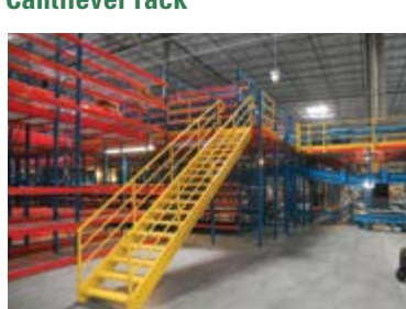
Elevated work platforms