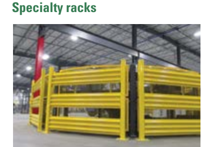
Steel guard rail