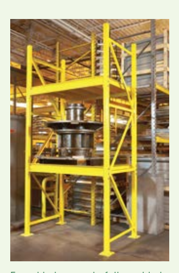
For added strength, fully welded tubular steel is used for both horizontal and diagonal bracing.

SK4000 is available with a bacteria-resistant finish.