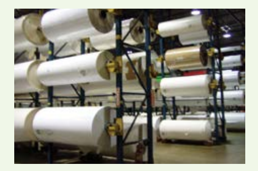
Columns are available in three standard sizes – 3"x 3," 3"x 4," 4"x 4."