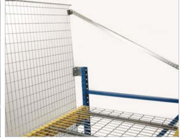
Adjustable extension kit allows you to extend panels past uprights