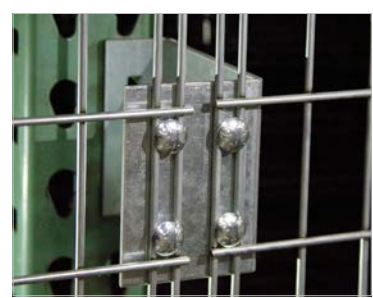
Offset brackets are available in different distances