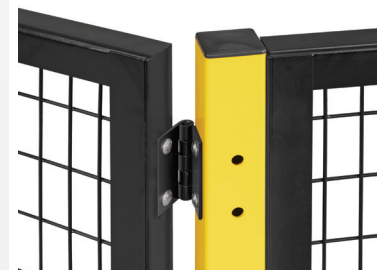
The angle panel kit can join two panels at any angle.