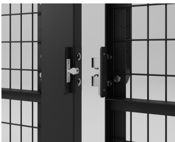
Multiple lock options available (Snap Lock shown)