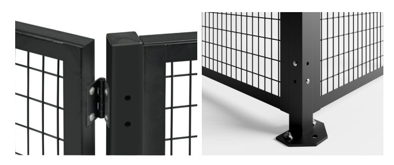
The angle panel kit can join two panels at any angle