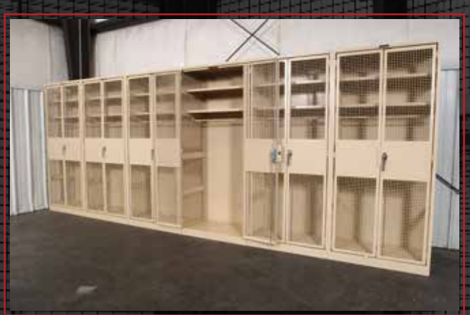
TACTICAL GEAR STORAGE