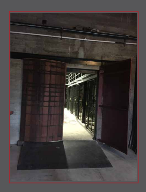
Lockers customized to your needs.