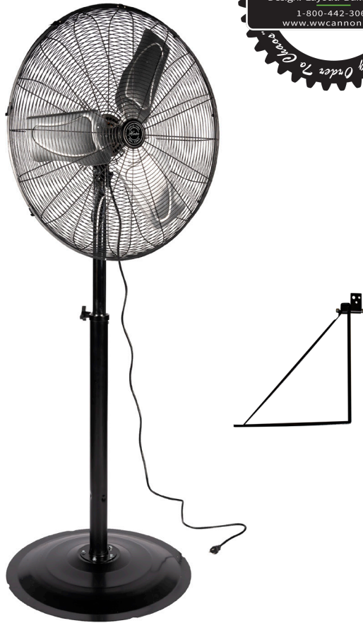
*Accessory wall mount must be purchased separately.

Hunter Industrial & Commercial is proud to present Hunter Air Circulators , a line of reliable, cost-efficient industrial air circulators from the only company with over 130 years in the air movement industry.