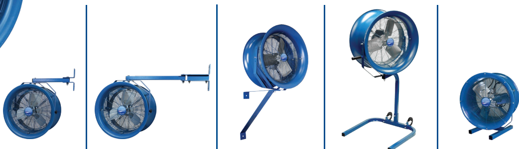
RM Rack Mount TC Truck Cooler CW Column-Wall PS Portable Stroller PB Pedestal Base