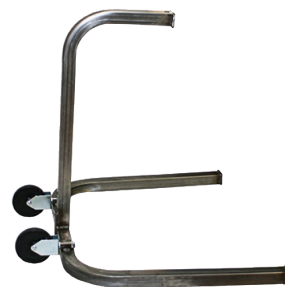
PS Portable Stroller 92 lbs (w/ fan)