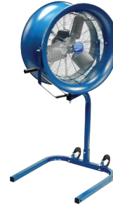
PS Portable Stroller