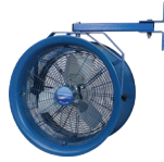
RM Rack Mount