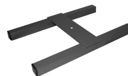
PB Pedestal Base 140 lbs (w/ fan)