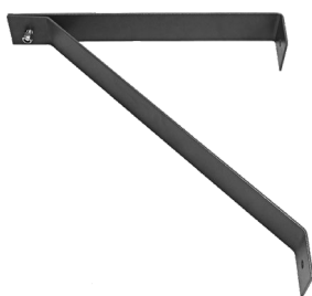
CW Column-Wall 145 lbs (w/ fan)