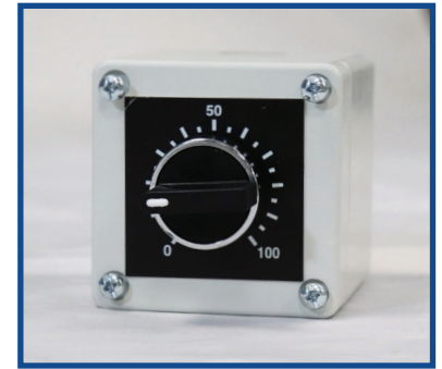
Optional Speed Controller Knob