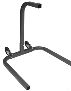
PS Portable Stroller Stainless Steel