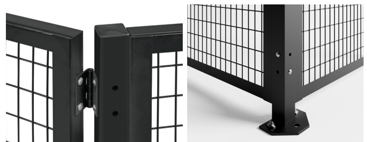
The angle panel kit can join two panels at any angle