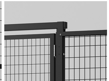
Adjustable Header Bar