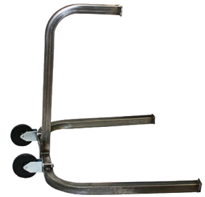
PS Portable Stroller 161 lbs (w/ fan)