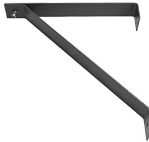
CW Column-Wall 145 lbs (w/ fan)