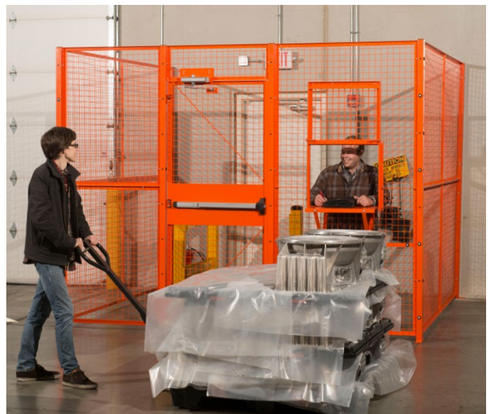
Averts theft of equipment, tooling, and finished goods. Flexible design.