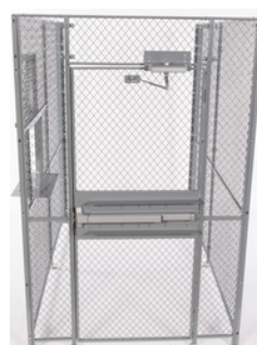
Hinged Door with Closer