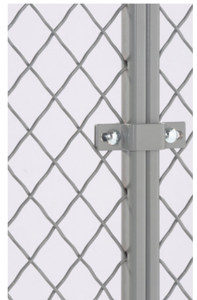
10-Gauge Triple Crimped Steel with Colonel Clamp