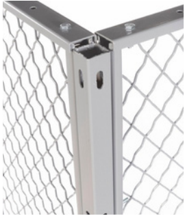
FWP at Corner

Line posts are constructed of 3½" x 1¼" channel with 4" x 7½" base plates for reinforcing fencing. It's recommended to use line posts every 15 linear feet on 7' and 8' high systems. But, on 9', 10', and 12' high systems, lines posts are needed every 10 linear feet.