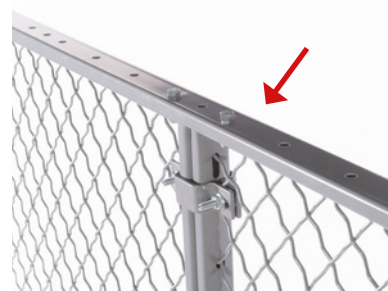
Top Capping Channels