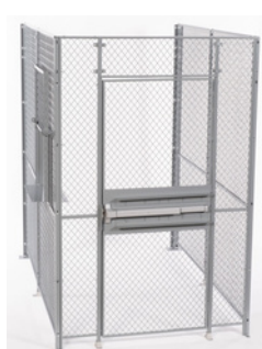
Hinged Panic-Bar Door