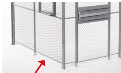
3.7" Sweep Space

Panel frames are interlocked at the corners with mortised and tenon joints then punched with slotted holes for easy installation. Each panel has a 3.7" sweep space allowing for cage housekeeping. A cold, rolled sheet metal sweep guard may be added for high security applications. Another unique feature of FordLogan panels are the 1½" x ½" roll-formed top capping channels that bolt through horizontal frames to enclose wires and provide extra rigidity.