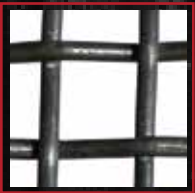
1/2" Sq. 12 Gauge *Actual Size

With a name like WireCrafters, it goes without saying that we offer a variety of welded and woven wire mesh at the industry's most competitive prices. Our standard mesh is a 2"x1" 10 Gauge. Optional meshes shown below.