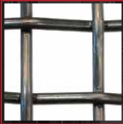
3/4" Sq. 10 Gauge *Actual Size