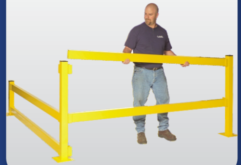
Modular Protective Barrier