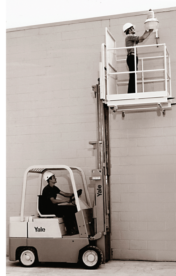
SERVICING AND MAINTENANCE