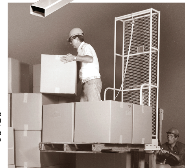
SM-301 STOCKMASTER MOUNTED ON STANDARD LIFT TRUCK FOR STOCK PICKING