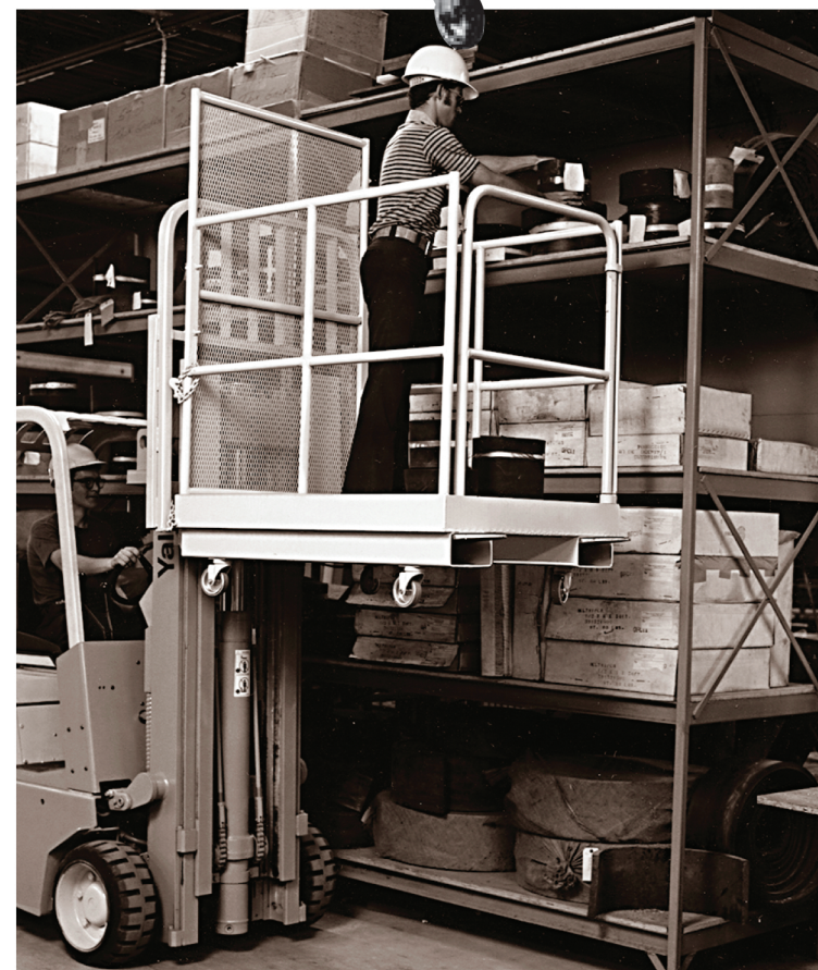
STOCKING AND RETRIEVAL