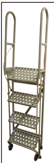
OPEN-READY TO USE FOLDED-TO STORE