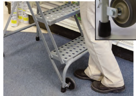
COTTERMAN PERFORMA PERFORATED TREAD FOR GENERAL USE IS OUR MOST SLIP RESISTANT TREAD

The New Cotterman StockN-Store ladder provides an easy convenient means to access shelving or other work areas. This lightweight ladder easily folds into a compact assembly for quick rolling movement and storage. In use, the ladder opens smoothly during the transition from rolling to setting down on rubber feet, the hinges automatically locking in place. For added convenience, the ladder tilts and rolls in the open as well as closed position.