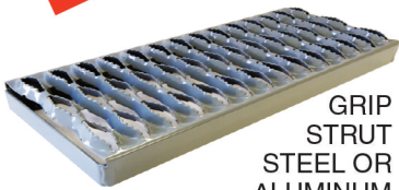
GRIP STRUT STEEL OR ALUMINUM

Handrail cross tube standard on aluminum models