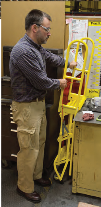
GRIP STRUT TREAD PROVIDES MAXIMUM SLIP RESISTANCE IN INDUSTRIAL ENVIRONMENTS