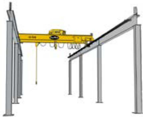
FREESTANDING RUNWAY SYSTEM