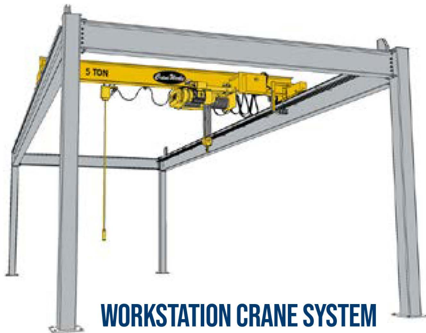
WORKSTATION CRANE SYSTEM