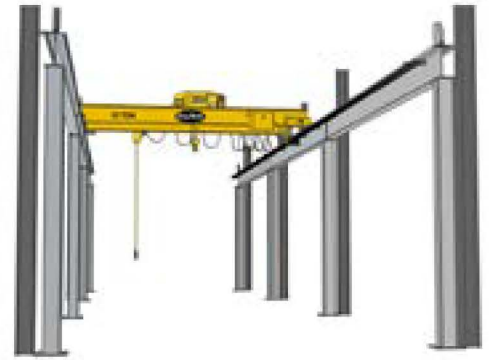
SEMI-FREESTANDING RUNWAY SYSTEM