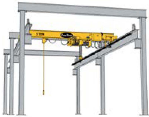
HEADER-BRACED RUNWAY SYSTEM