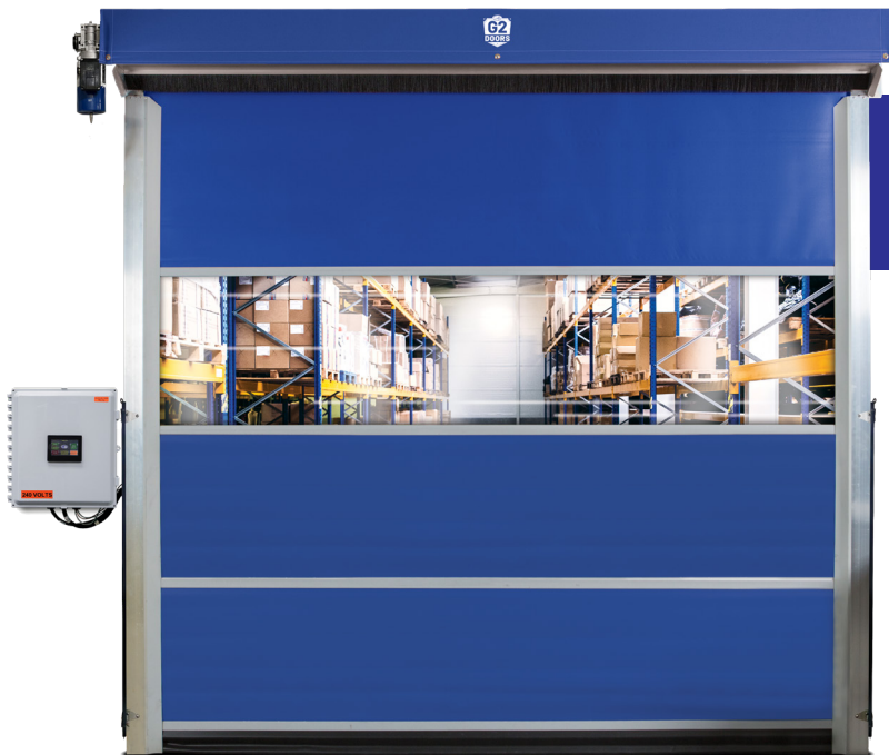
10'x10' door with blue & vision replaceable panels.

Our G2 high performance doors are available with the options you want and the reliability you need for your facility. Whether you are looking for a high speed door fully integrated with your building's safety systems, or simply a reliable door to separate your spaces, G2 doors minimize downtime and maximize profitability in your facility.