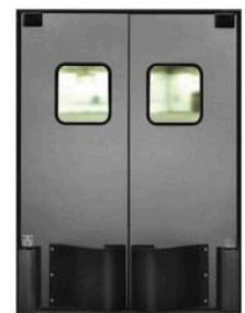
Model HCP-10 shown with bumpers.