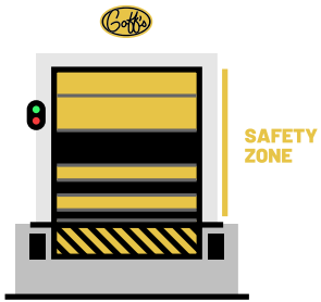
Fall Guard Safety System

While the other guys aim to check the OSHA box, they create additional risk by allowing falls over or through their "barrier." Fall Guard creates a complete safety zone covering the entire opening of your loading dock, ensuring maximum safety while minimizing risk at your facility.