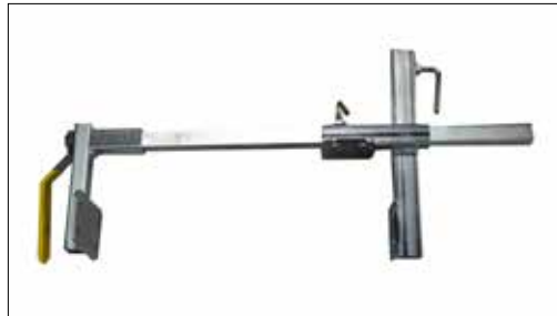
Tool Free Perimeter Clamp