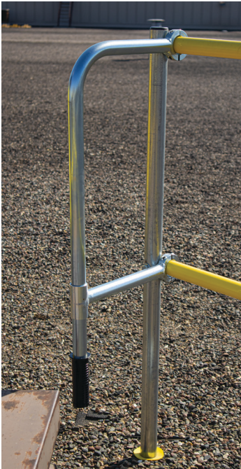
Optional deluxe grab bar provides increased safety and sense of security.