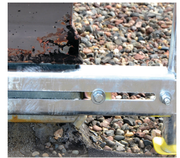
Wide slots provide a wide adjustment range.