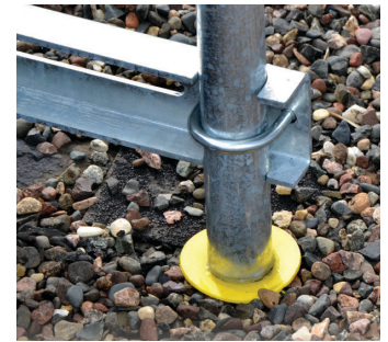
Yellow foot pads protect delicate roofs.