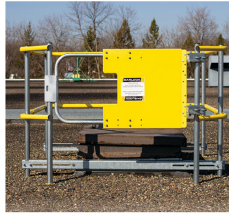
Self-closing gate prevents accidental entry.