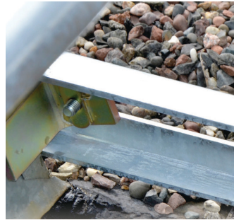
Unique compression fit design. No drilling!