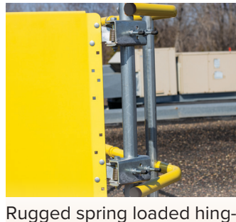
Rugged spring loaded hinges allow the gate to open to the left or right.