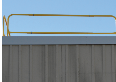
Adjustable rails minimizes precise measuring