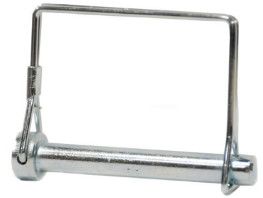
Tool free system uses pin with locking bail