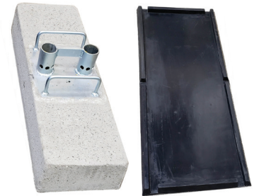
Set and Prevent base and optional pad, best value