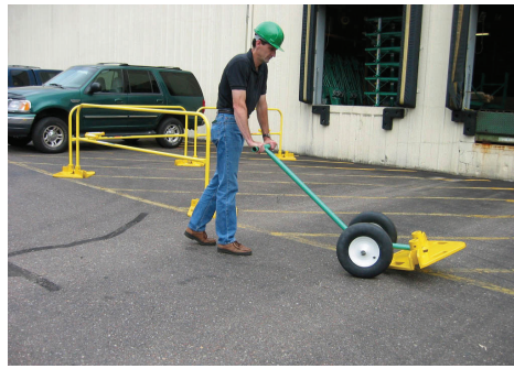
Base transporter for metal or Set and Prevent base