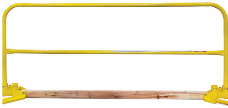
Integrated toe board adapter for 2 X 4 lumber