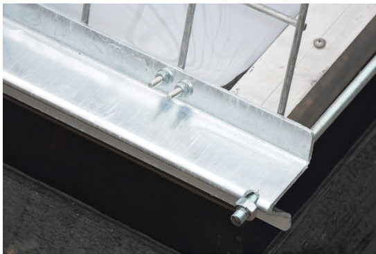
Rugged Compression Fit Design