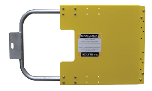
Fits openings from 17" to 48"