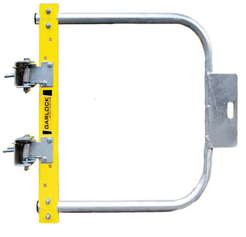
Fits openings between 14" and 30"