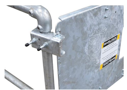
Vertically adjustable hinges for installation flexibility