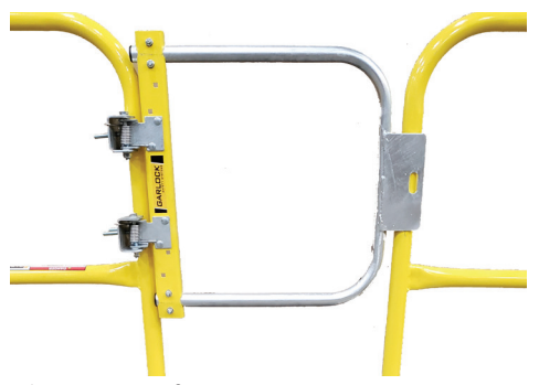
SlimFit gate for narrow openings