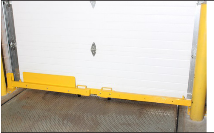
The left gate is shown with optional extended cart shield. The right gate is shown as standard.

The Door SHIELD™ is designed to protect the bottom panel of the overhead door from the daily dings and collisions caused by pallets and rolling carts. The Door SHIELD lowers in front of the door protecting the bottom panel by engaging with the floor or dock leveler preventing items from being pushed into the door.