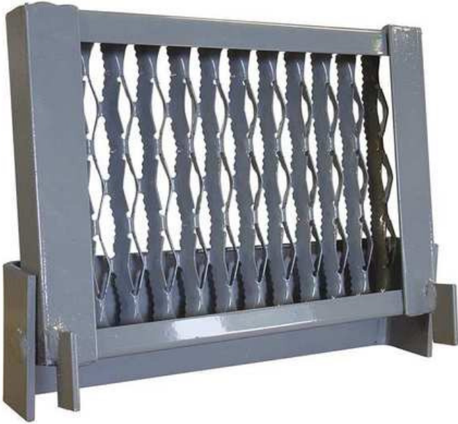
Flip Up Step in the stored position