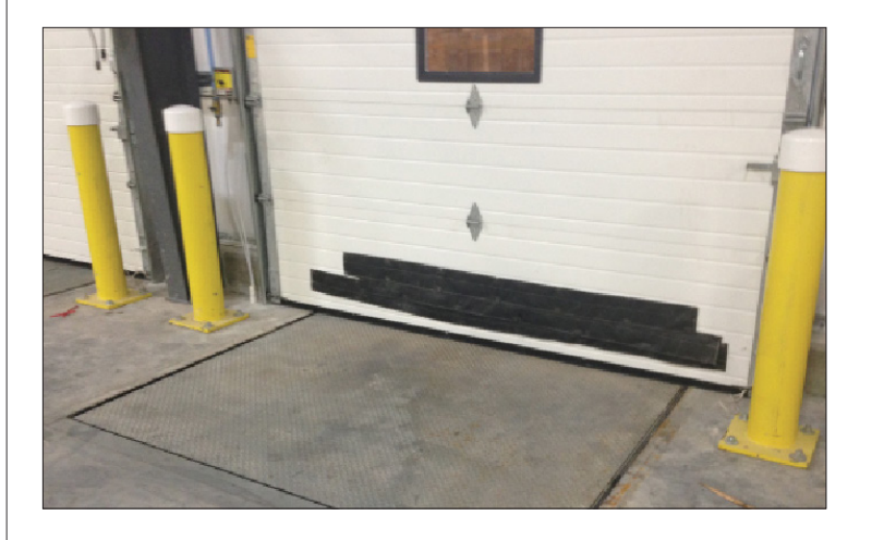
When cleaning in and around the loading dock area, the Mag-Seal can be easily stored on the overhead door. This helps ensure the correct strips stay with the correct loading dock and prevents the Mag-Seal from getting lost.

The Mag-Seal provides a quick and efficient seal at the edges of your loading dock pit leveler, requiring no welding or professional installation. Simply place strips over gaps between the dock leveler and the pit wall. The heavy duty magnets along both edges of the Mag-Seal secures it both to the leveler deck plate and the pit curb angle providing maximum protection against the outside elements.