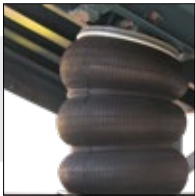
Steel belted rubber bellows system uses compressed air to raise platform.

If the electrical push button option is desired, the control utilizes a 115V circuit to power an extremely low amp (.073 amp) solenoid which activates the system.