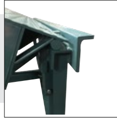
McGuire also has the only dock leveler that employs a full width rear hinge mounted in compression, using a 1” diameter solid steel rod.

Using the same technology found in air ride suspension, the CA steel belted rubber bladder lifting mechanism is built with an industrial automotive-grade bellows system, which exhausts air through a cartridge valve located in the pit, and has a maximum lifting capacity of 55,000 lbs.