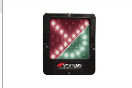
Exterior lights are standard with LED for extended life. One light shows a red X and a green circle for color-impaired individuals.