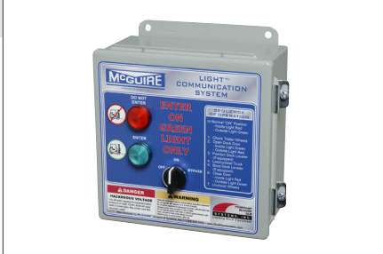
Dock Alert Communication System Control panel for automatic lights - manual light control panel similar.