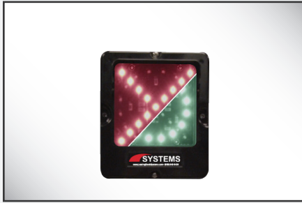
Exterior lights are standard with LED for extended life. One light shows a red X and a green circle for color-impaired individuals.