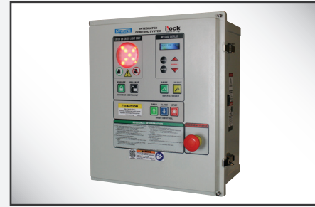
Upgrade to iDock Controls with optional integrated equipment for a more efficient loading dock.

The iDock™ Alert Light Communication System is an enhanced version of McGuire's simple Dock Alert and provides a reliable warning system that establishes a clear line of communication between truck drivers and dock personnel, thereby reducing the risk of accidents at the loading dock.