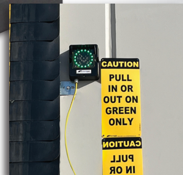
* iDock Alert controls shown with optional dock light button.