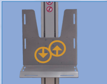
Platform slots for securing loads with bungees or straps.