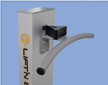
Ergonomic handle with lifting and lowering thumb switch.