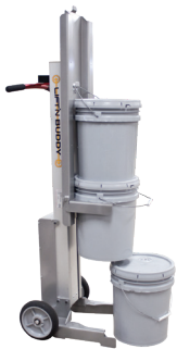
Lift'n Buddy Pail Lifter