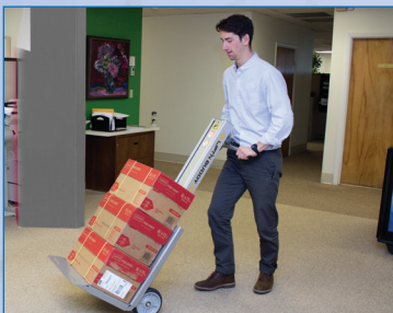
As simple to use as any 2-wheel hand truck.