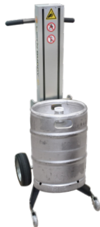
Lift'n Buddy Keg Lifter