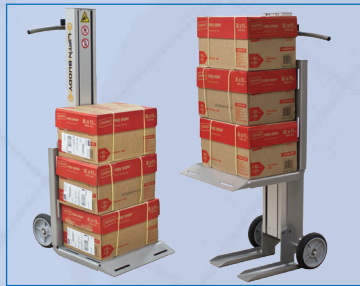
Base legs allow the it to stand even when loaded and raised.