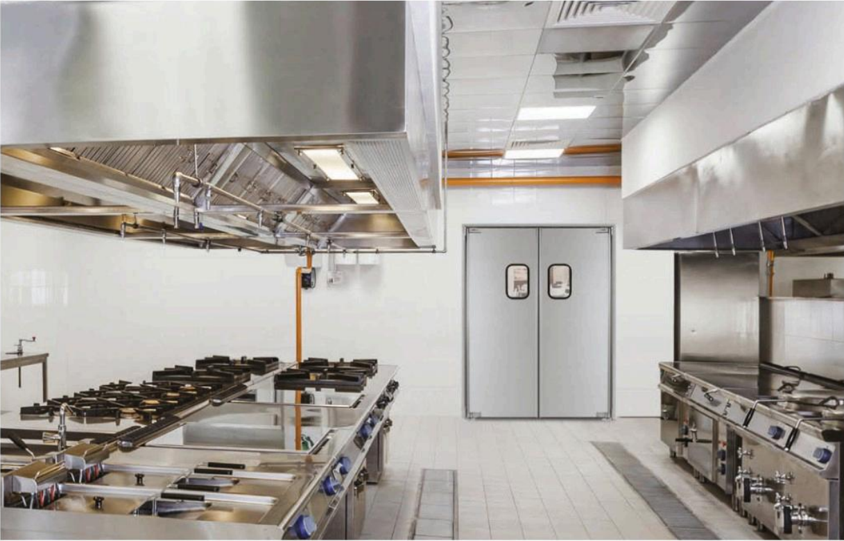
LWP Series shown in a kitchen application.