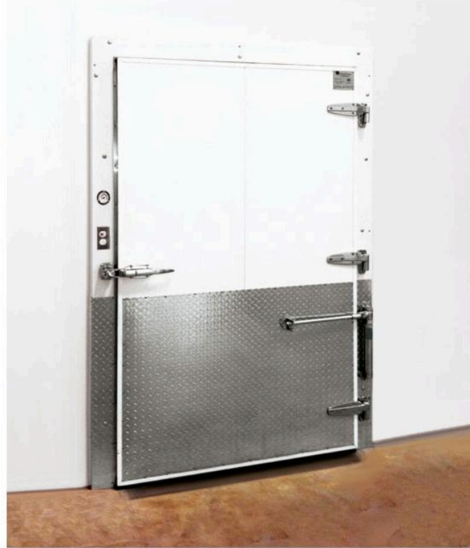
Chase ColdGuard Swinging Door shown in cold storage application.

AVAILABLE OPTIONS: Various Cladding Options, Accessory and Hardware Options, 6" Door Thickness for Extreme Cold