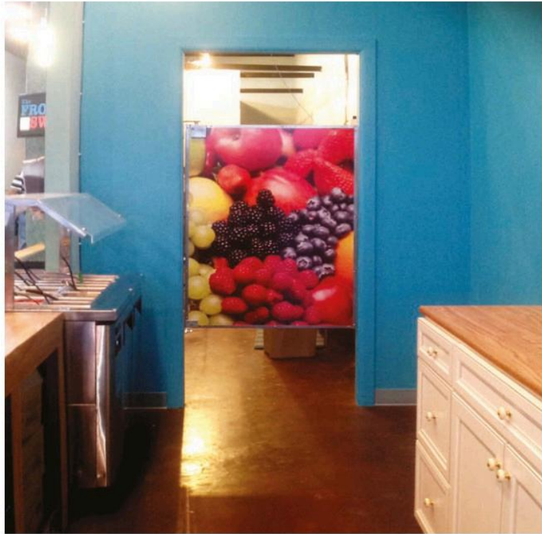
SCP Gate / Cafe shown in a restaurant application with a graphic door option added.

TRAFFIC: Pedestrian & Push Cart APPLICATIONS: Kitchen & Restaurant, Retail & Supermarket DOOR BODY: .75" sustainable, moisture resistant, composite wood core, 1" total door thickness. .032" decorative high-pressure laminate (both sides) EDGE TRIM: Black plastic molding HINGE: Eliason Easy Swing® Hinge AVAILABLE OPTIONS: Contour top and bottom, graphic door model option.