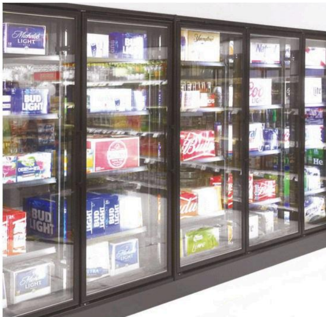
Thermoseal Glass Series line-up shown above.