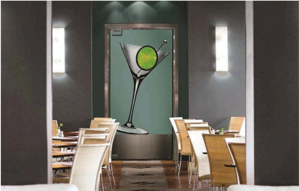
SCP Series shown in a dining to kitchen application with graphic door option.