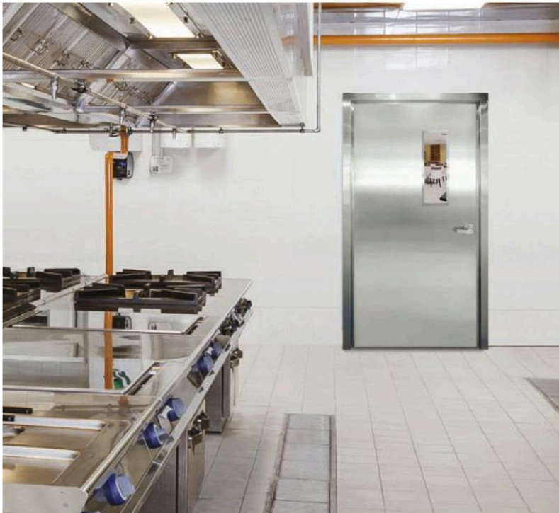
Eliason Stainless Steel Flush Door shown in kitchen application.