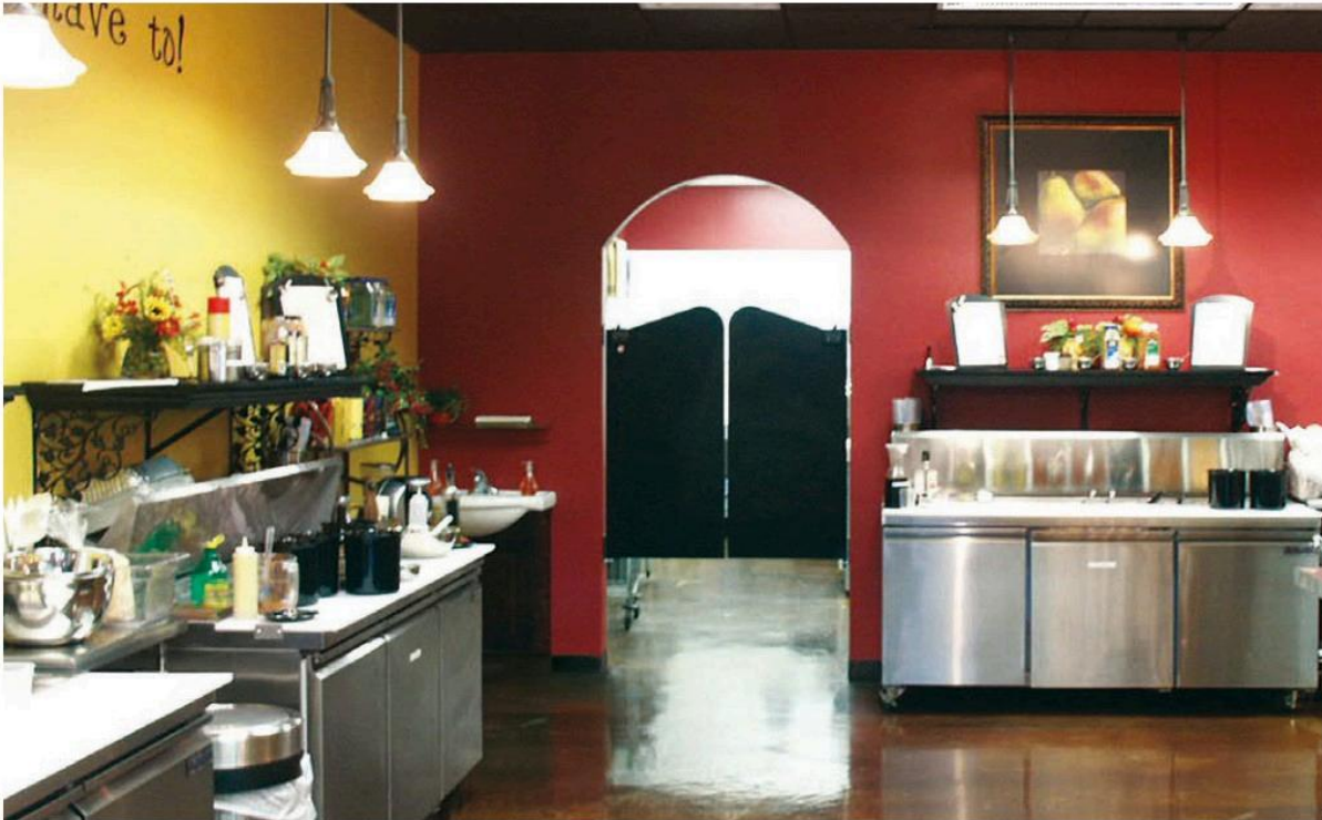
Eliason SCP Cafe Door shown with contour top in kitchen application.