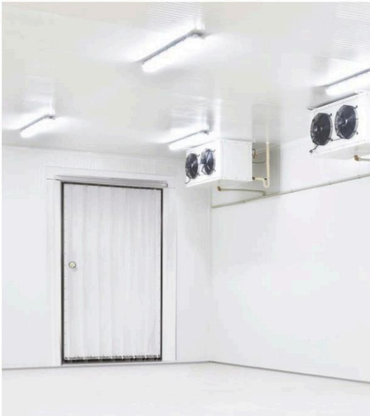
Strip Door shown in a walk-in freezer application.