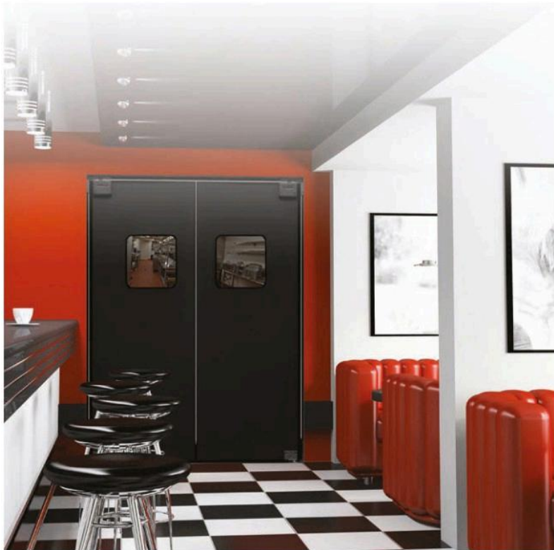
P-11 Plus shown in a dining application.

AVAILABLE OPTIONS: 9" x 30" ADA-Compliant windows, stainless steel back spine