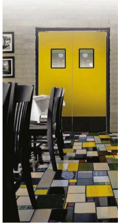
Eliason SCP-15 shown in a dining application.

TRAFFIC: Pedestrian & Push Cart APPLICATIONS: Kitchen & Restaurant, Retail & Supermarket DOOR BODY: .75" sustainable, moisture resistant, composite wood core, 1" total door thickness. WINDOW: 9" x 14" gasketed window, clear acrylic HINGE: Eliason Easy Swing® Hinge AVAILABLE OPTIONS: Window options, Impact / Kick Plates, .032" decorative high-pressure laminate (both sides), Full perimeter gasketing (specify SCG series), Graphic Door options available.