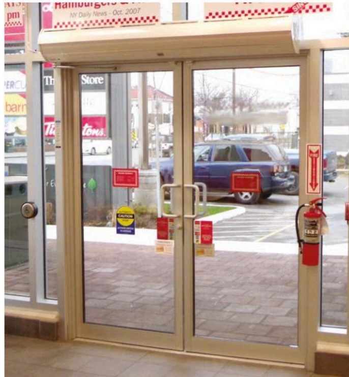
Horizontal Microshield Air Barrier shown in a restaurant application.

AVAILABLE OPTIONS: Color Options Available