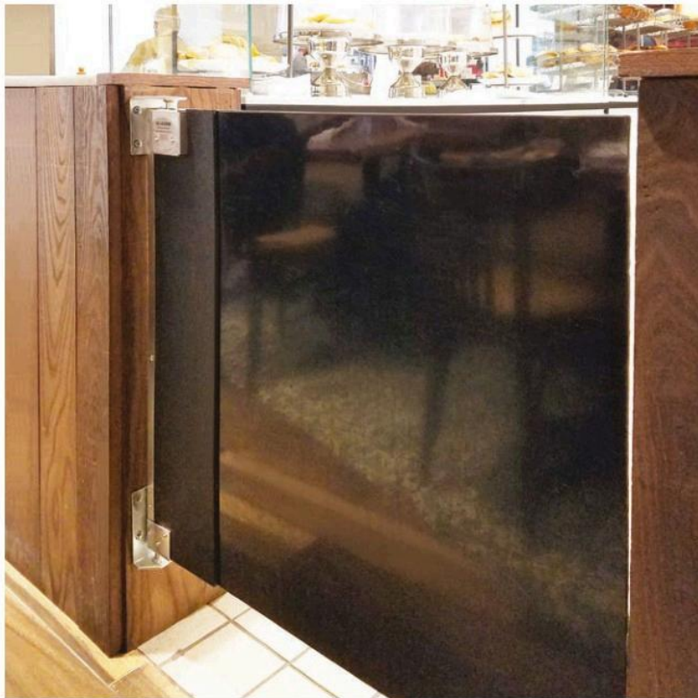
PMP Gate / Cafe shown in a dining / counter application.