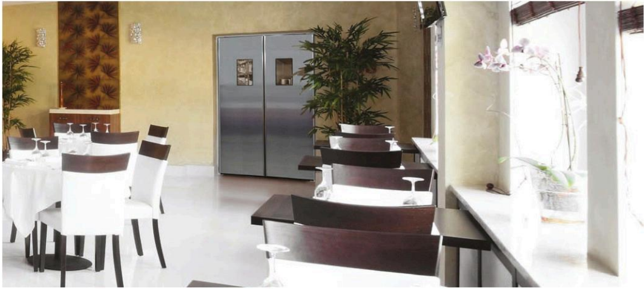
Eliason EHH-3 shown in a dining application.