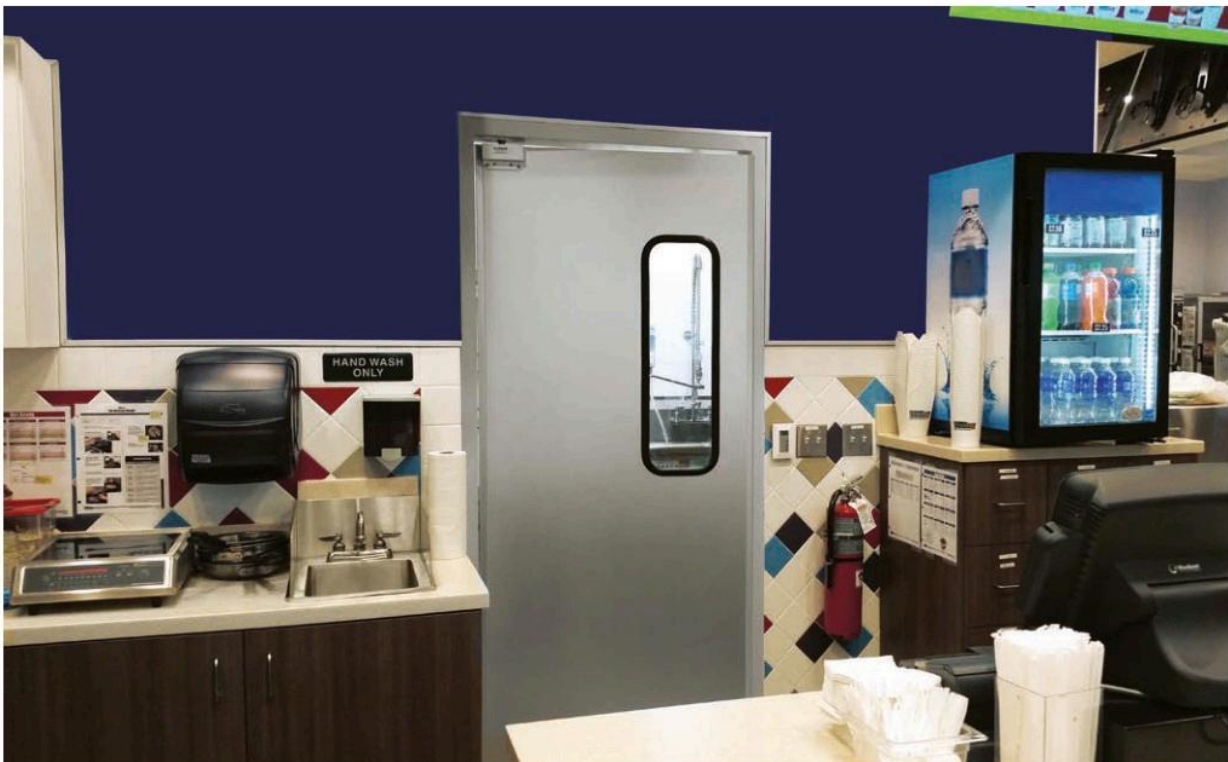
Eliason LWP-3 shown with optional elongated window to meet ADA Compliance.

TRAFFIC: Pedestrian, Push Cart, Pallet Jack APPLICATIONS: Kitchen & Restaurant, Retail & Supermarket DOOR BODY: .063" thick tempered aluminum alloy with delta formed vertical edges, anodized aluminum finish. WINDOW: 9" x 14" clear acrylic set in black rubber molding HINGE: Eliason Easy Swing® Hinge AVAILABLE OPTIONS: Various window options, 12" high stainless steel base plate (both sides), .032" decorative high-pressure laminate (both sides).