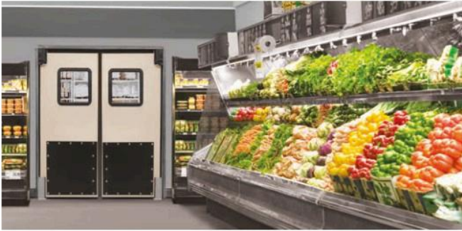
SUPERMARKETS / GROCERY STORES