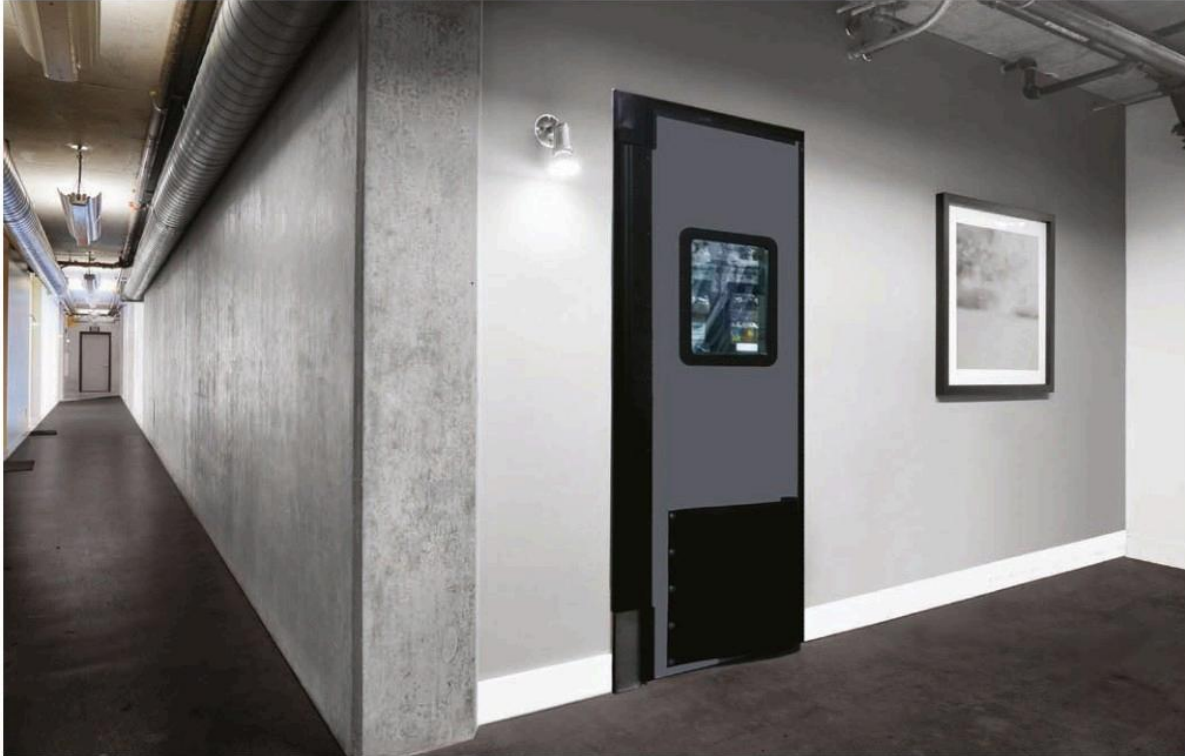
Durulite Retailer R25D shown in a back storage application.

AVAILABLE OPTIONS: Various Window Sizes, Impact / Kick Plates, Teardrop Bumpers, Cart Guards, Locking Devices, 180° x 90° Hardware, SlideTrac Bumpers™