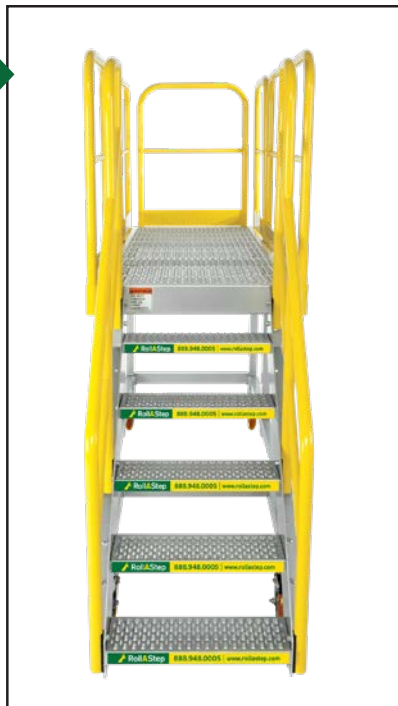
▲ Full-size, powder-coated handrails.