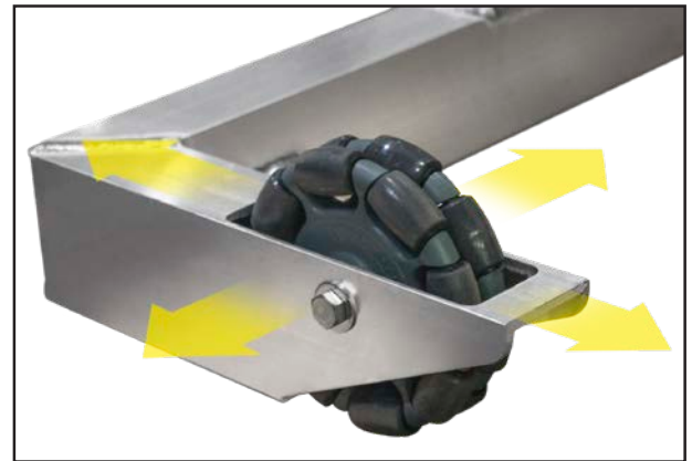
▲ The unique side-rolling casters make the TR Series easy to position in tight areas.