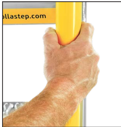
▲ Full-size, powder-coated handrails.