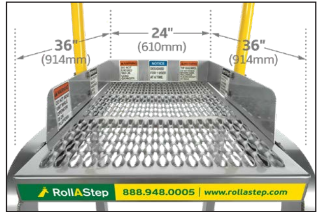
▲ Six square feet of work area is roomy enough for an operator, tools and parts.