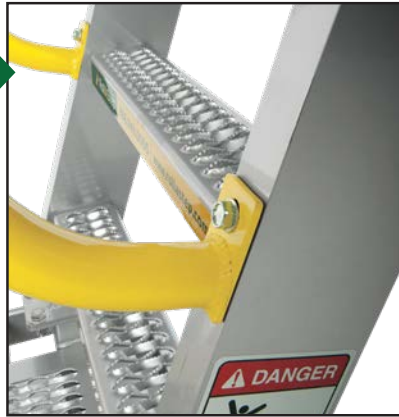
▲ All-weather slip-resistant tread.