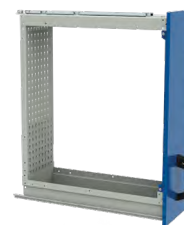
Vertical Drawer (RL31)