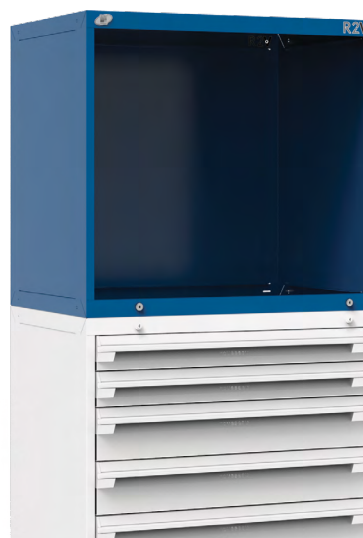
R2V Housing for Two Users (RL29)