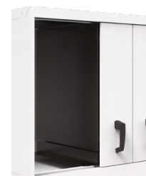
Security Panel (RL91)