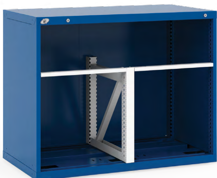
Multi-Drawer Housing for Two Users (RA34, RA45+RA46)