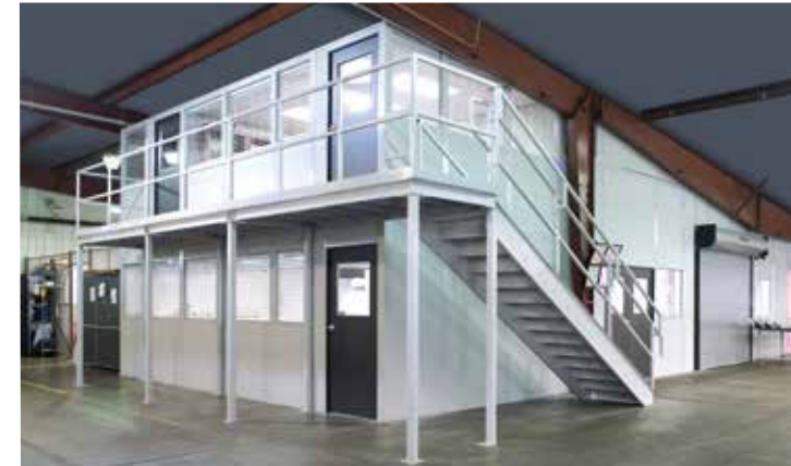
Superior Pre-engineered Modular Systems

When change means construction. And time equals money.