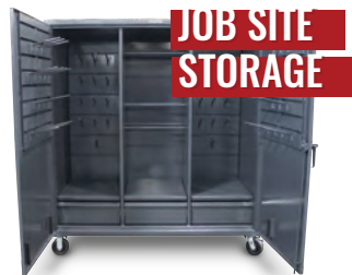
JOB SITE STORAGE