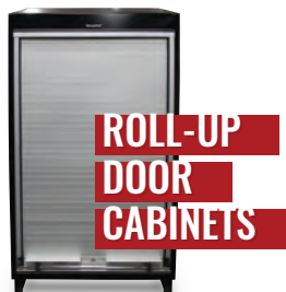
ROLL-UP DOOR CABINETS