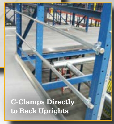
C-Clamps Directly to Rack Uprights