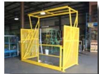
Pallet Drop Zone Gate

Made of heavy duty construction and mounts directly to mezzanine or rack platform railing.