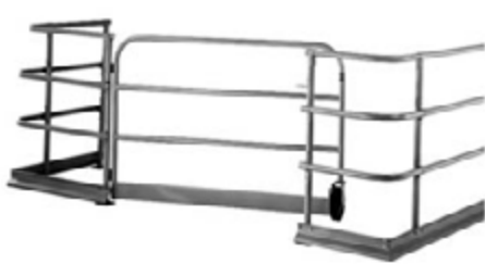
Single and Double Swing Gates

Hinged to the vertical guard rail posts and rolls using an 8 inch wheel. Single gate widths available from 4 to 6 ft, and double gate widths available from 6 to 10 ft.