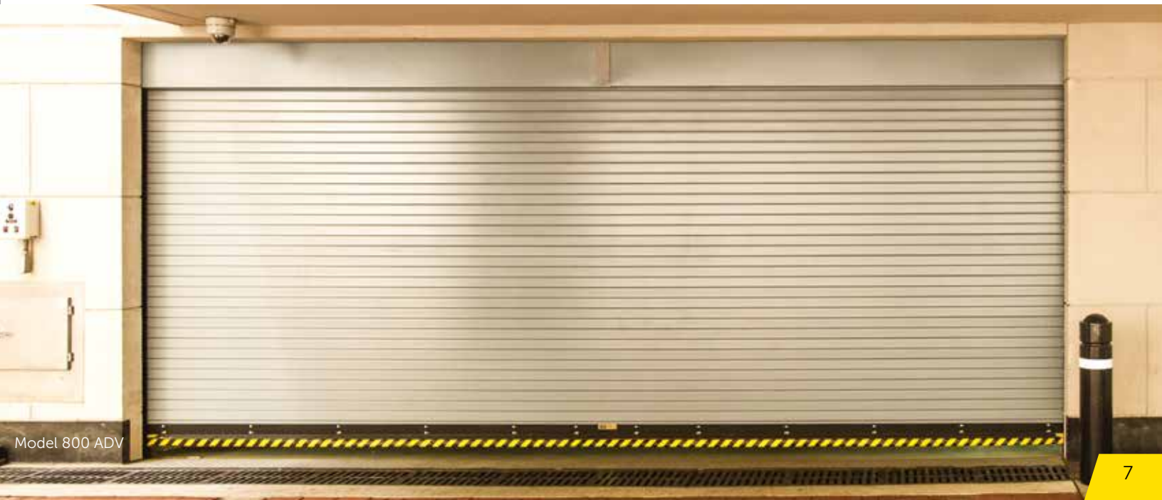
Model 800 ADV

You'll find Wayne Dalton in the manufacturer directory at SWEETS.com. Our full specifications and CAD files are available on the SWEETS website.