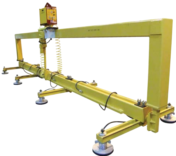
Electric upender shown horizontal.