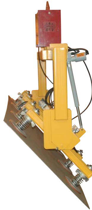
Electric upenders allow the operator to position the plate anywhere from 0 to 90 degrees.