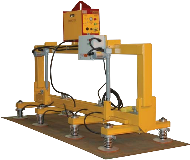
Steel plate shown horizontal.

Ideal for material that needs to be tilted up or down for inspection or placement into shipping containers.