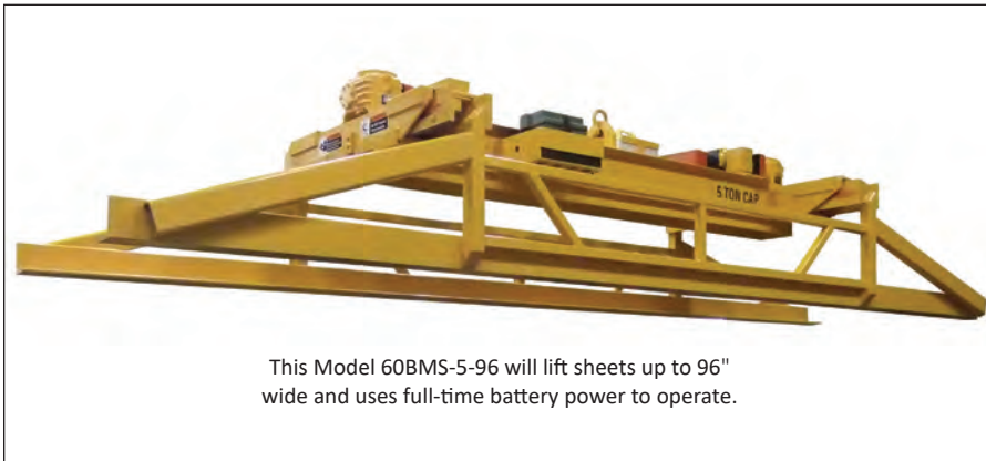
This Model 60BMS-5-96 will lift sheets up to 96" wide and uses full-time battery power to operate.