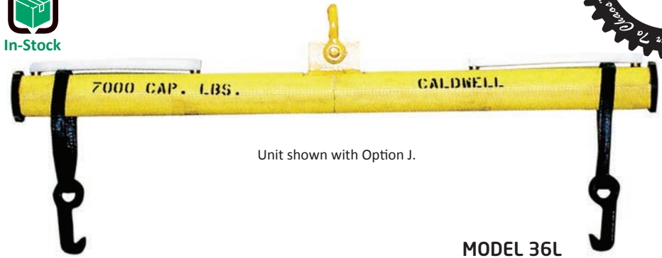
Unit shown with Option J.